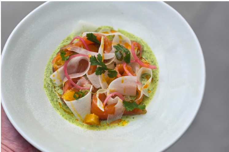
DON JULIO TEQUILA CURED SALMON