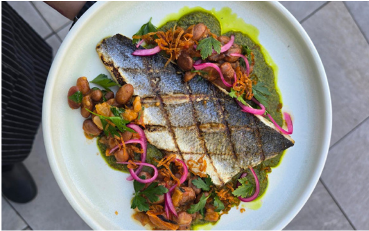
GRILLED SEA BREAM

Try some of our delicious new food and beverage options now available throughout the Club.