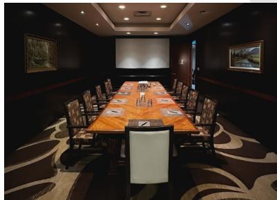
the bina & jonathan gill family boardroom

Terms and pricing subject to change any time. Reservations may be cancelled via email up to 24 hours in advance without penalty; the cancellation fee will be equal to the booking duration. To reserve a Club Room, please contact Grill staff directly or email reserve@tclub.com .