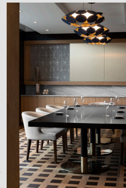
the dr. ignatius cheung room (access through the grill restaurant)